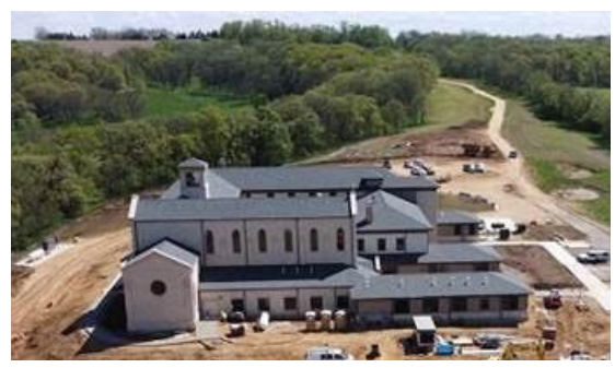
See a photographic story on the progress at: https://build.valleyofourlady.org/news/

Fundraising continues with sponsorship for chapel-related furnishings, paving and solar array.